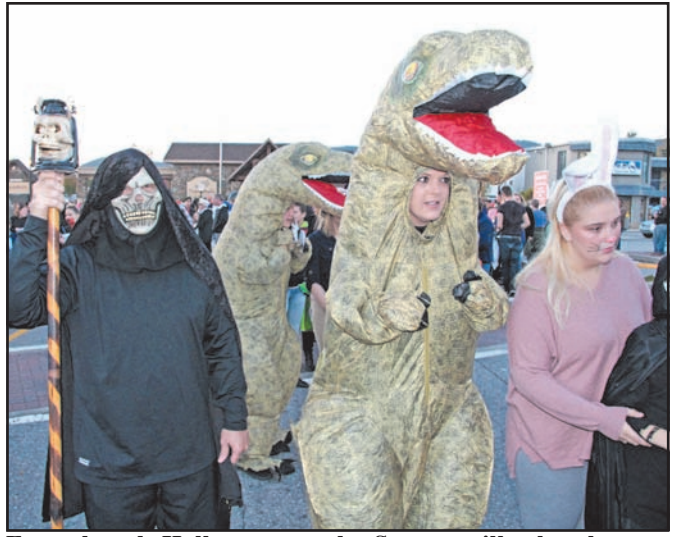
Even though Halloween on the Square will take place on Saturday this year, it still promises to be just as much fun as in

"Setup is from 5:30-6 See Halloween, Page 2A